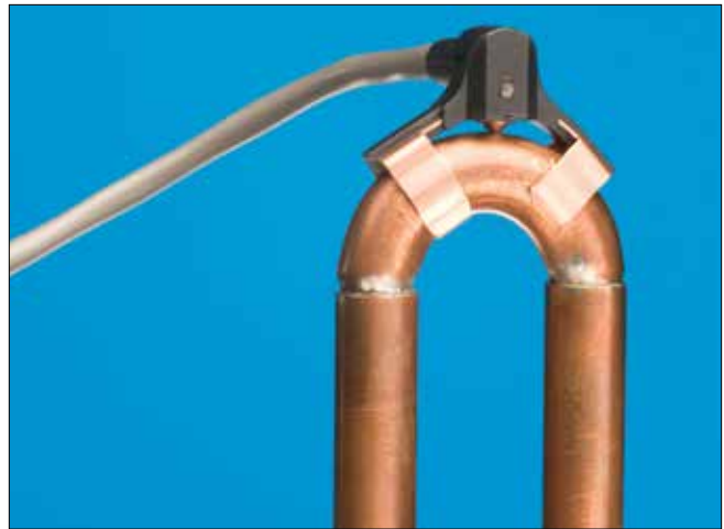
Sens-A-Coil Thermistor Sensor

This patented (Patent #6,814,486 B2) design from MS is the solution for sensing condenser and evaporator return bend temperatures. The Sens-A-Coil comes standard with 10ft. of AWG#22 PVC jacketed cable. Please contact the factory for specific design or application information or the availability of options.