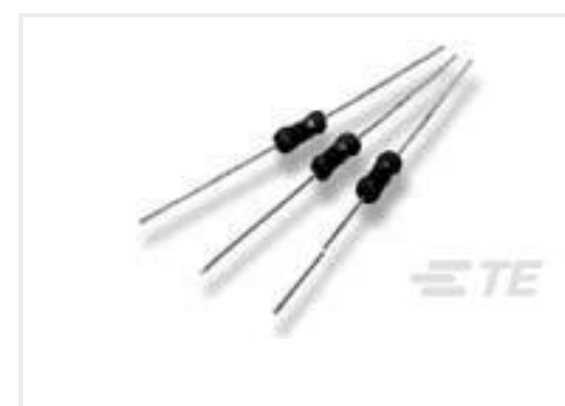
TE Part #4-1879355-9 RR03 5% 430K AMMO