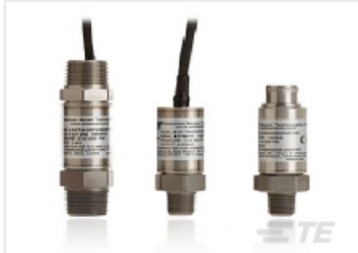
TE Part # CAT-PTT0045 Intrinsically Safe Pressure Transducer