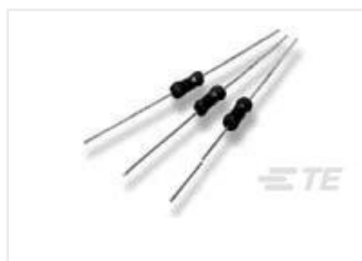
TE Part #7-1879350-5 RR01 5% 270R AMMO