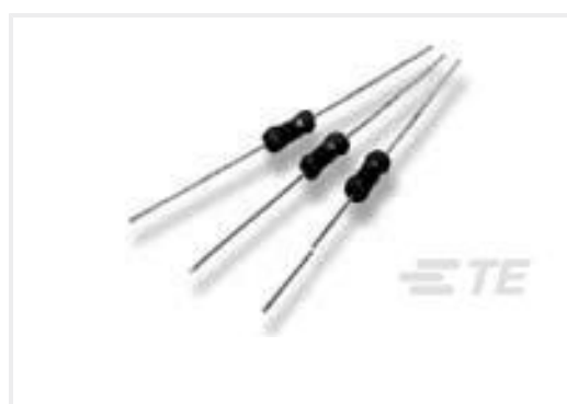
TE Part #1-1625893-4 5W SM M/OX 2% 27R