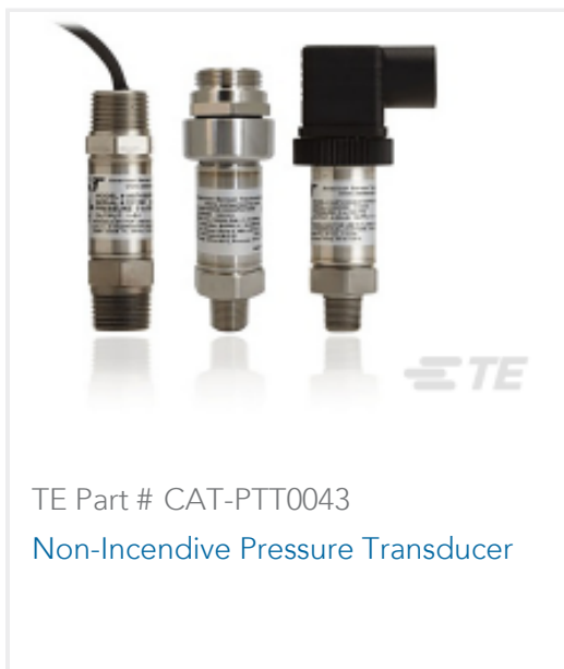
TE Part # CAT-PTT0043 Non-Incendive Pressure Transducer