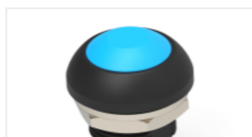
TE Part #2-2329383-5 PB ON/OFF FC BLU M1 TERM IP68