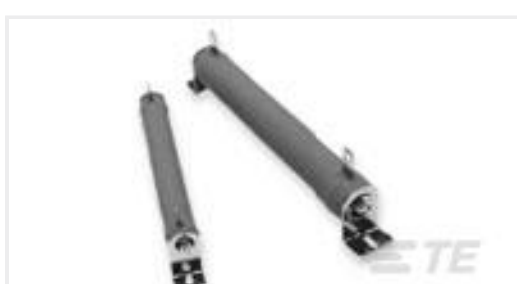
TE Part #1-1879447-8 TE 200W 27R 5% Bracket