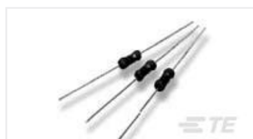
TE Part #1-1625893-4 5W SM M/OX 2% 27R