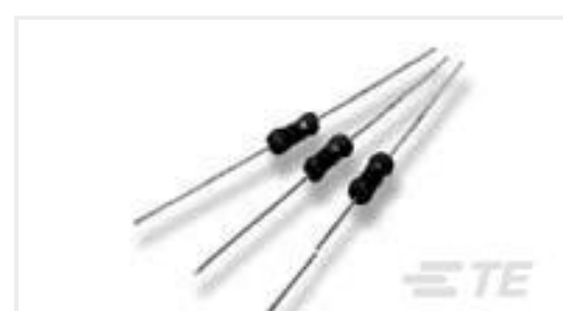
TE Part #7-1879350-5 RR01 5% 270R AMMO