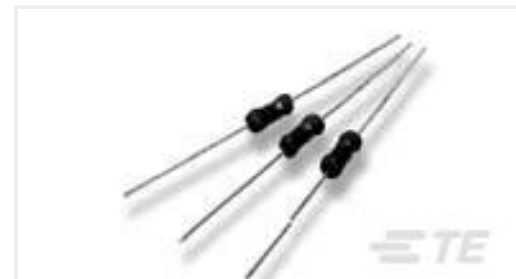
TE Part #4-1879355-9 RR03 5% 430K AMMO