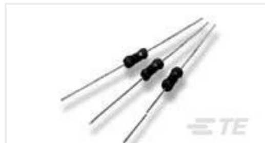
TE Part #7-1879350-5 RR01 5% 270R AMMO