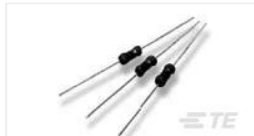
TE Part #1-1625893-4 5W SM M/OX 2% 27R