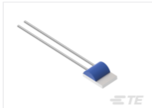
TE Part #NB-PTCO-163 Pt1000, 2.0x2.3, Class C, PTFC102C1A0