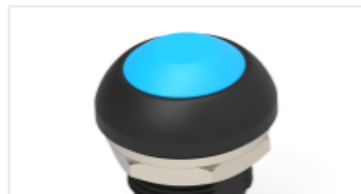
TE Part #2-2329383-5 PB ON/OFF FC BLU M1 TERM IP68