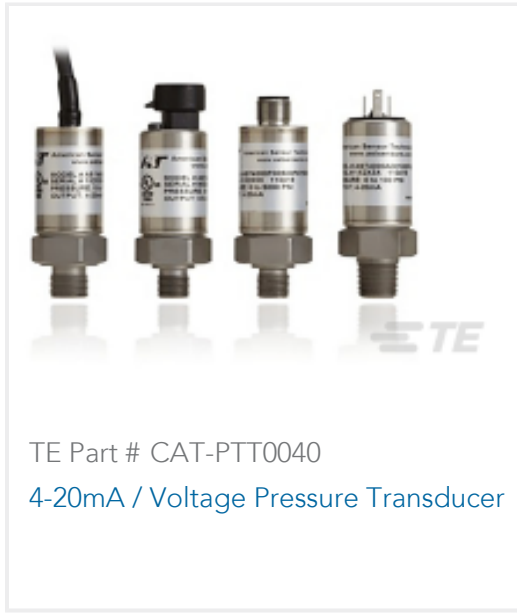
TE Part # CAT-PTT0040 4-20mA / Voltage Pressure Transducer