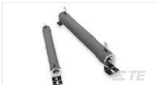
TE Part #1-1879447-8 TE 200W 27R 5% Bracket