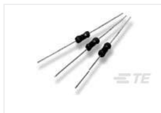
TE Part #1-1625893-4 5W SM M/OX 2% 27R (#8)