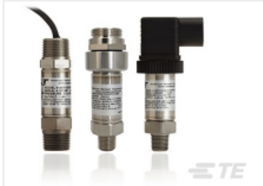
TE Part # CAT-PTT0043 Non-Incendive Pressure Transducer