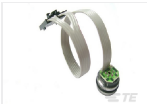
TE Part #86-100G-R 100 PSIG RIBBON CABLE MV PRESSURE SENSOR