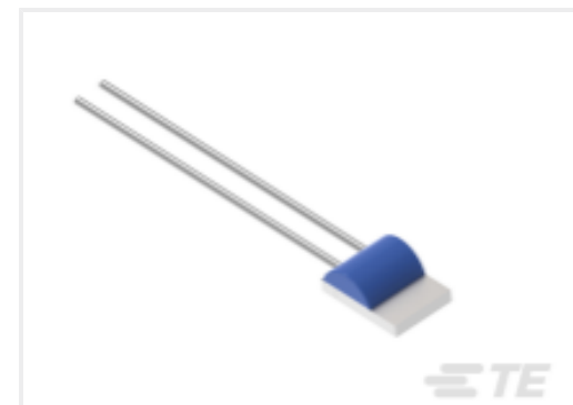
TE Part #NB-PTCO-159 Pt100, 2.0x2.3, Class C, PTFC101C1A0