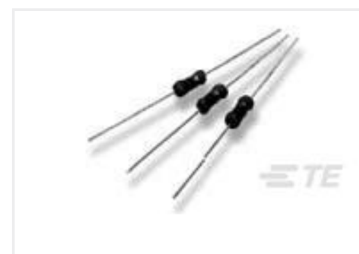
TE Part #4-1879355-9 RR03 5% 430K AMMO