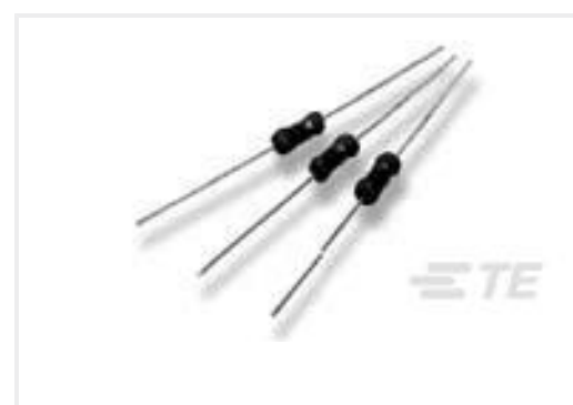
TE Part #7-1879350-5 RR01 5% 270R AMMO