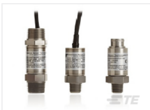
TE Part #CAT-PTT0045 Intrinsically Safe Pressure Transducer