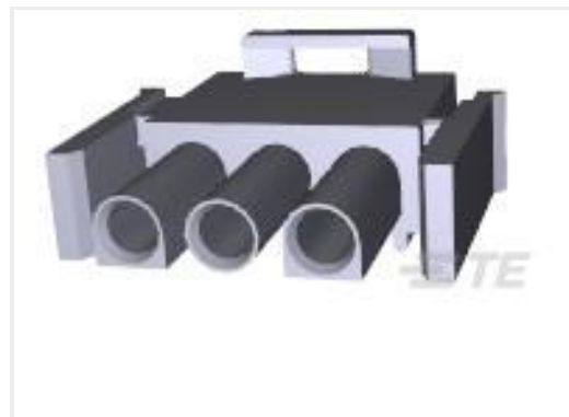
TE Part #1-480700-0 03P UMNL PLUG HSG NATL