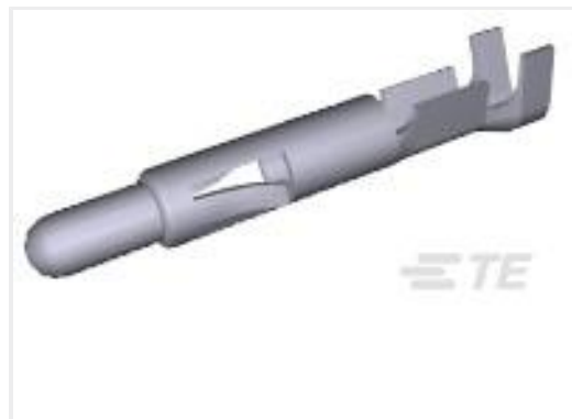
TE Part #350690-7 UMNL PIN 24-18 AUBR L/P