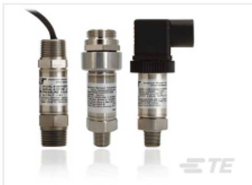
TE Part #11192563-00 AST4300A00200P4P1000:CTO-13000000-03