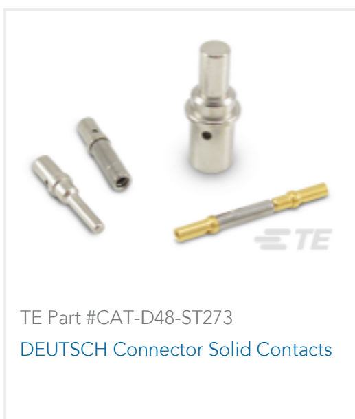
TE Part #CAT-D48-ST273 DEUTSCH Connector Solid Contacts