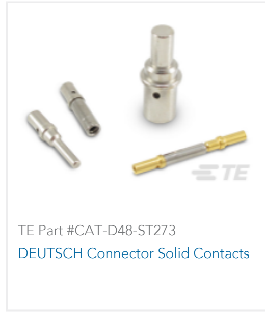
TE Part #CAT-D48-ST273 DEUTSCH Connector Solid Contacts