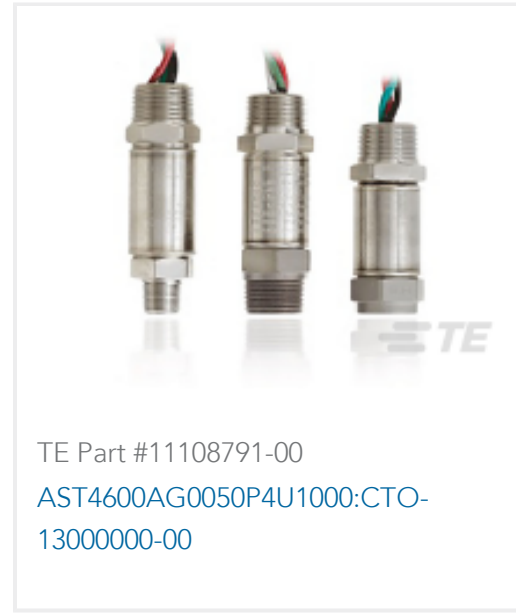
TE Part #11108791-00 AST4600AG0050P4U1000:CTO-13000000-00