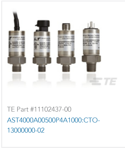
TE Part #11102437-00 AST4000A00500P4A1000:CTO-13000000-02