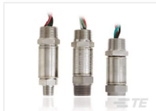
TE Part #11108663-00 300 PSI, 1/4MNPT, 4-20mA, Conduit, 18AWG