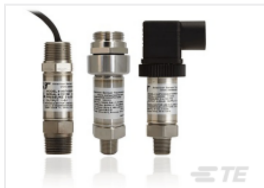
TE Part #11105776-00 AST4300A00200P4L1000-SS:CTO- 13000000-03