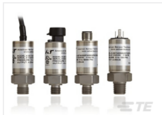
TE Part #11104267-00 AST4000F05000P4D0000:CTO- 13000000-02