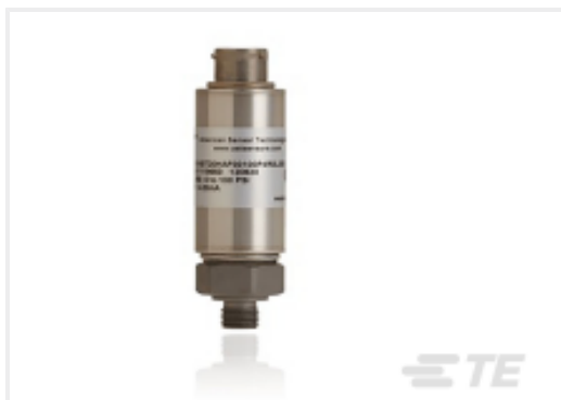
TE Part #11191401-00 AST20HAA05000P51H000:CTO- 13000000-04