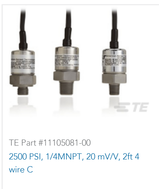
TE Part #11105081-00 2500 PSI, 1/4MNPT, 20 mV/V, 2ft 4 wire C