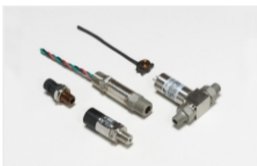
Industrial Pressure Transducers(17)