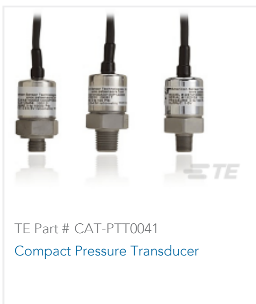
TE Part # CAT-PTT0041 Compact Pressure Transducer