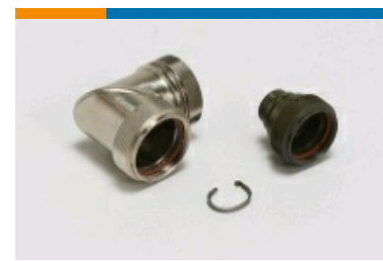
Fiber Optic (55)