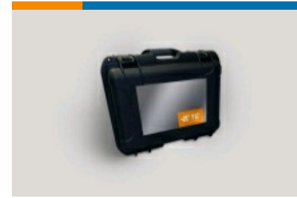
Coax Cable Termination (41)