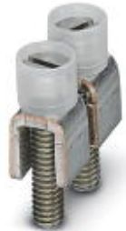
Fixed bridge, Number of positions: 2, Color: silver

Please be informed that the data shown in this PDF Document is generated from our Online Catalog. Please find the complete data in the user's documentation. Our General Terms of Use for Downloads are valid ( http://phoenixcontact.com/download )