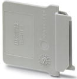
Path extension, color: gray

Please be informed that the data shown in this PDF Document is generated from our Online Catalog. Please find the complete data in the user's documentation. Our General Terms of Use for Downloads are valid ( http://phoenixcontact.com/download )