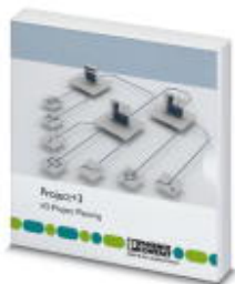
Configuration tool for Inline and Axioline F-I/O stations

Please be informed that the data shown in this PDF Document is generated from our Online Catalog. Please find the complete data in the user's documentation. Our General Terms of Use for Downloads are valid ( http://phoenixcontact.com/download )