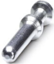
Turned 4.0 crimp contact, individual male contact, core diameter 4.00 mm 2 , silver-plated

Please be informed that the data shown in this PDF Document is generated from our Online Catalog. Please find the complete data in the user's documentation. Our General Terms of Use for Downloads are valid ( http://phoenixcontact.com/download )