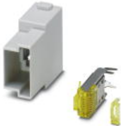
Contact insert module, Number of positions: RJ45, Type: RJ45, Pin, Application: Data

Please be informed that the data shown in this PDF Document is generated from our Online Catalog. Please find the complete data in the user's documentation. Our General Terms of Use for Downloads are valid ( http://phoenixcontact.com/download )