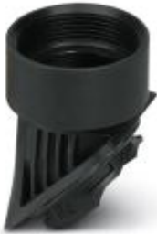
Adapter, plastic, for EVO housing, M40 thread

Please be informed that the data shown in this PDF Document is generated from our Online Catalog. Please find the complete data in the user's documentation. Our General Terms of Use for Downloads are valid ( http://phoenixcontact.com/download )