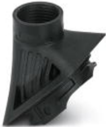
Adapter, plastic, for EVO housing, M25 thread

Please be informed that the data shown in this PDF Document is generated from our Online Catalog. Please find the complete data in the user's documentation. Our General Terms of Use for Downloads are valid ( http://phoenixcontact.com/download )