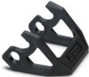
Replacement double locking latch for HEAVYCON EVO housing, HC-B10/HC-B16/HC-B24, PA

Please be informed that the data shown in this PDF Document is generated from our Online Catalog. Please find the complete data in the user's documentation. Our General Terms of Use for Downloads are valid ( http://phoenixcontact.com/download )