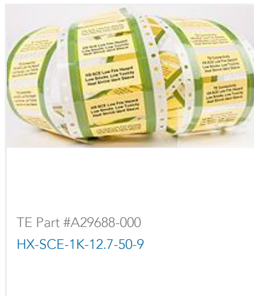
TE Part #A29688-000 HX-SCE-1K-12.7-50-9