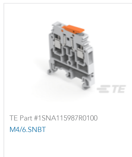
TE Part #1SNA115987R0100 M4/6.SNBT