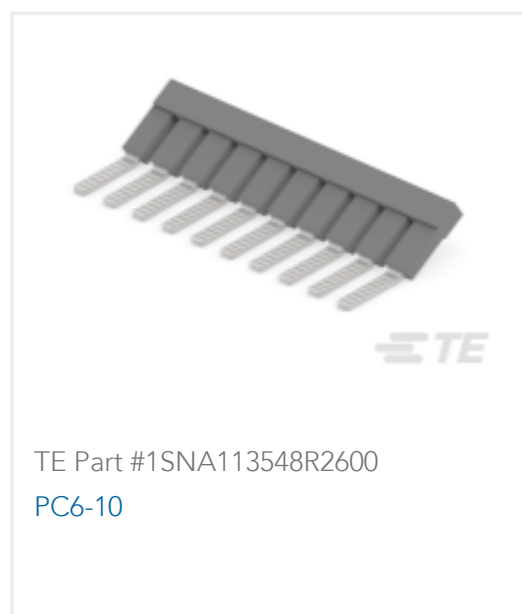
TE Part #1SNA113548R2600 PC6-10