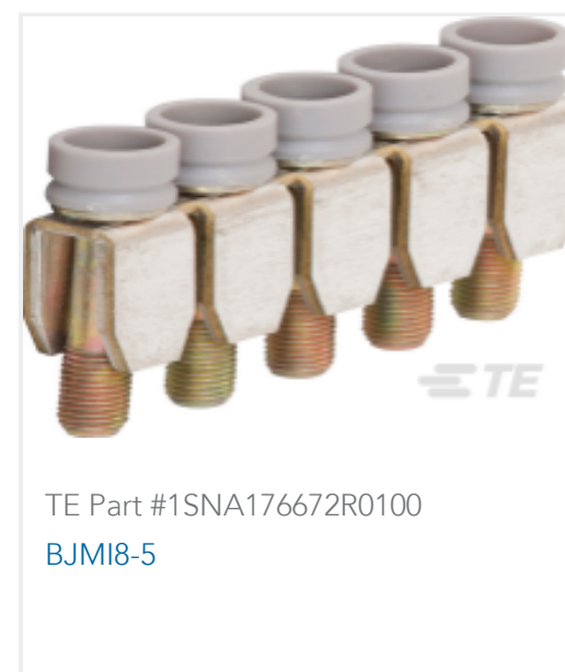
TE Part #1SNA176672R0100 BJM18-5