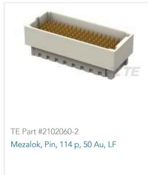
TE Part #2102060-2 Mezalok, Pin, 114 p, 50 Au, LF