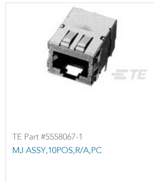
TE Part #5558067-1 MJ ASSY,10POS,R/A,PC