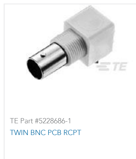
TE Part #5228686-1 TWIN BNC PCB RCPT