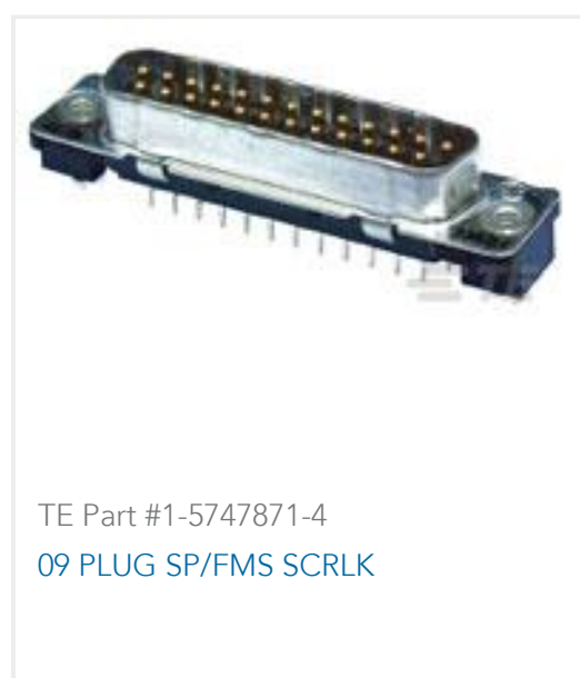
TE Part #1-5747871-4 09 PLUG SP/FMS SCRLK