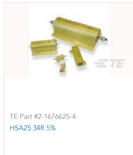
TE Part #2-1676625-4 HSA25 34R 5%