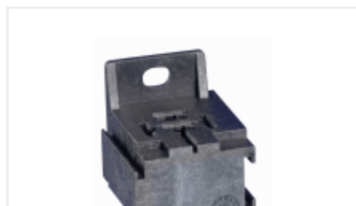
TE Part #1-1904045-2 V23333Z1001A008-EV-100