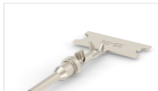
TE Part #4-2600020-2 XRC PIN TERMINAL 16-20AWG Ni Plated