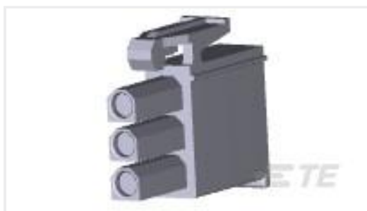
TE Part #172337-1 MINI UMNL PLUG HOUSING 3P