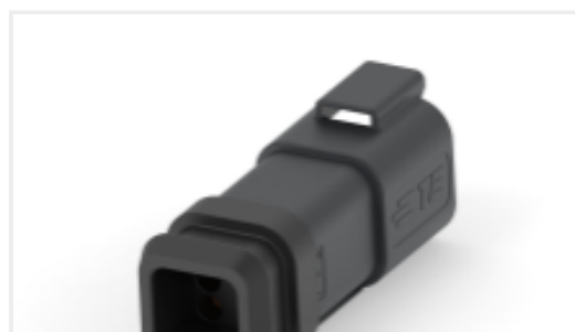
TE Part #1-2600034-9 6CCT BLACK RECEP W/SMALL SEAL & HS