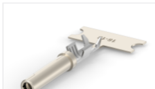
TE Part #4-2600021-3 XRC SOCKET 16-20 AWG Ni Plated