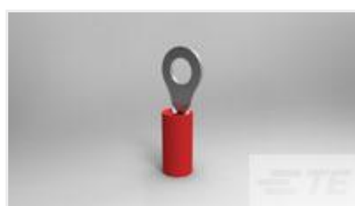
TE Part #320551 PIDG R 22-16 COMM 22-18 MIL 8