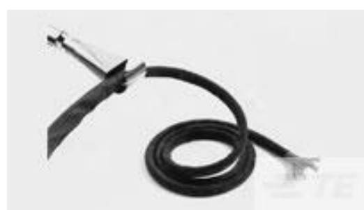
TE Part #CB03294012 RW-200-E-1/8-0-SP