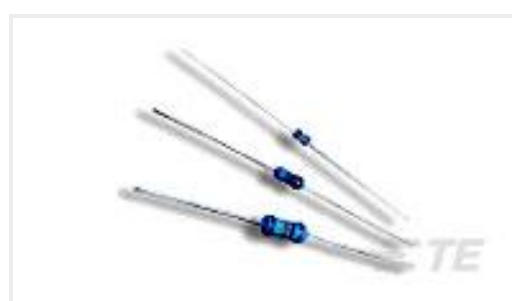
TE Part #1622297-1 LR1 1% 100R