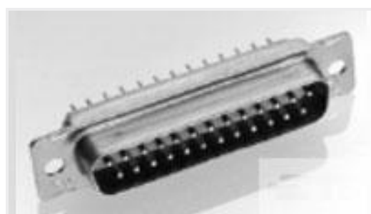
TE Part #207253-2 RECEPT ASSY, 9 POSN, AMPLIMITE