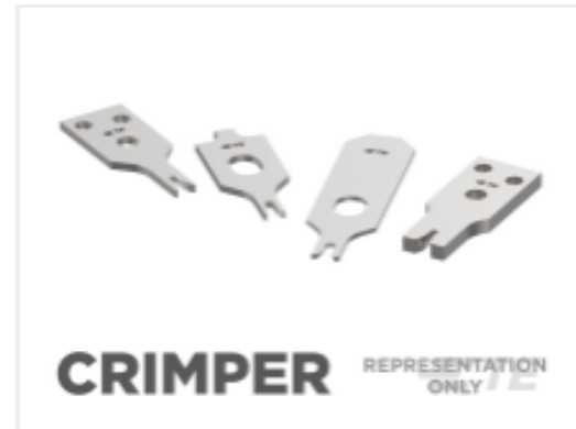
TE Part #1803143-6 CRIMPER, INSUL O