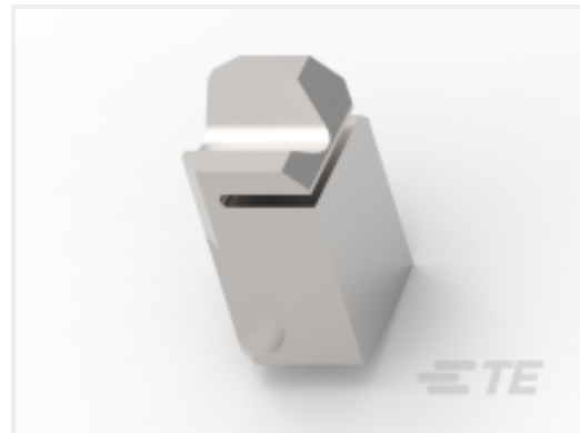
TE Part #1803095-6 FLOATING SHEAR, FRONT