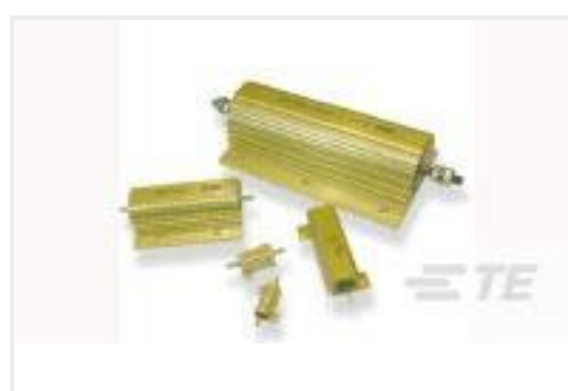
TE Part #2-1630024-2 HSC250 2R2 5%