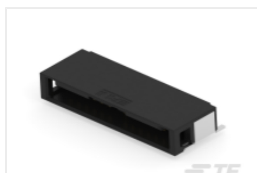
TE Part #514496-E MCBA 14 M * SMD 137 * 176 * GURT C7 J2