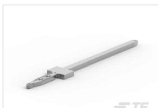
TE Part #CAT-AC853-T273 PRESS FIT PIN TERMINALS