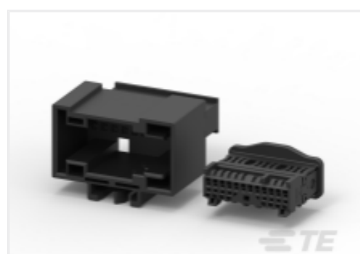
TE Part #CAT-M8793-CH8172 MQS, CONNECTOR HOUSING