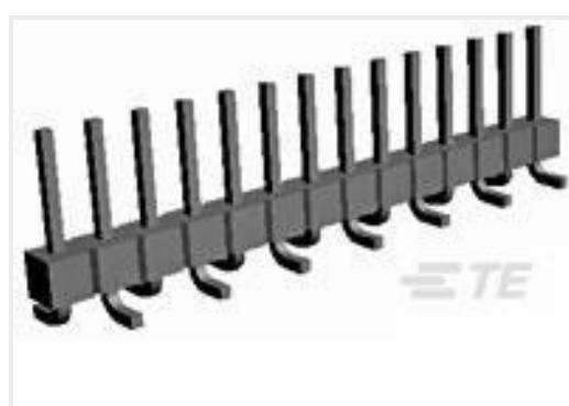
TE Part #1241150-3 3P MOD II BREAK AWAY HDR,SMD, BLISTER