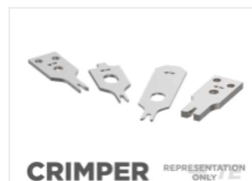
TE Part #690403-6 CRIMPER INSUL F