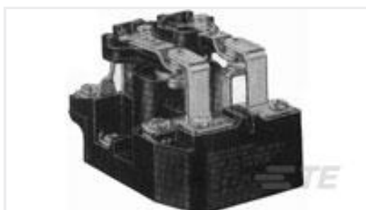
TE Part #6-1393127-2 PRD-11DY0-24=PRD-