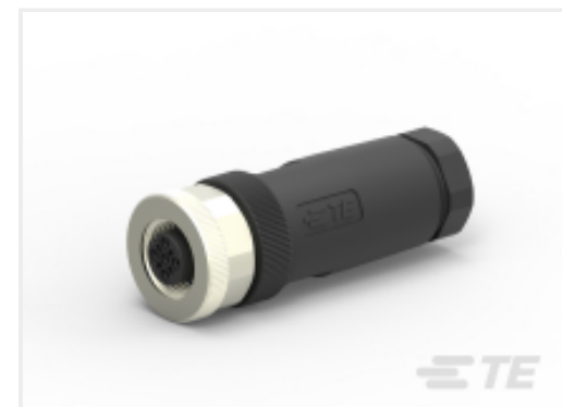
TE Part #T4110002031-000 M12,FEMALE,STRAIGHT,A CODE,3P,PG9,GOLD