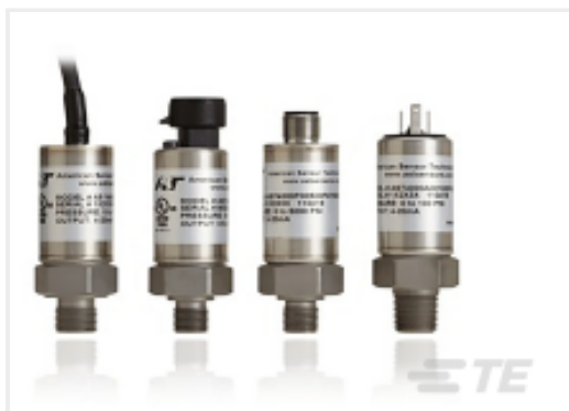
TE Part #20025872-00 AST4000CV0025P4K1000: CTO-13000000-02