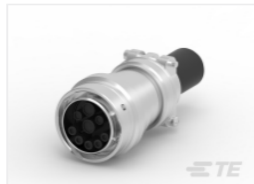
TE Part #HDB36-24-91SN-059 BR AWY PL ASM,MC