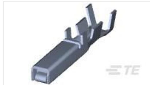
TE Part #175196-2 DYNAMIC D-3 REC CONT. L PdNi & AU 0.38