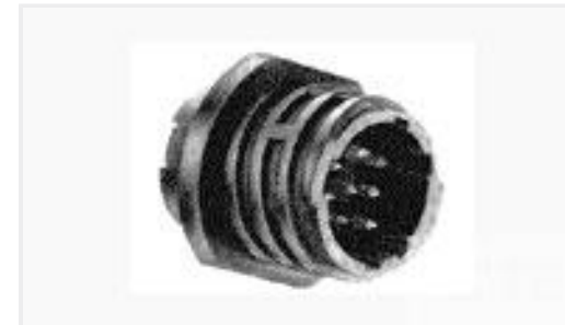
TE Part #205841-2 CPC RECPT ASSEMBLY SIZE 11-8