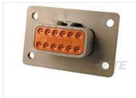
TE Part #DTM04-12PA-L012 REC, 12P, GRY, N, FLANGE, A