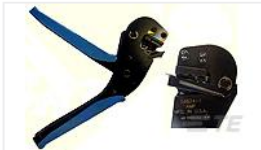
TE Part #59824-1 TETRA-CRIMP PIDG PG FASTON 22-10 ASSY