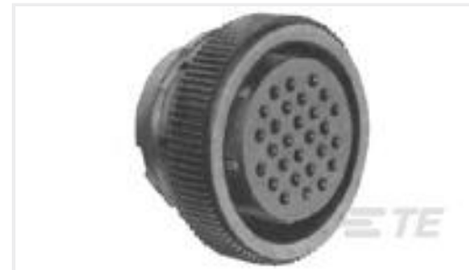
TE Part #205838-1 CPC PLUG ASSEMBLY SIZE 11-8