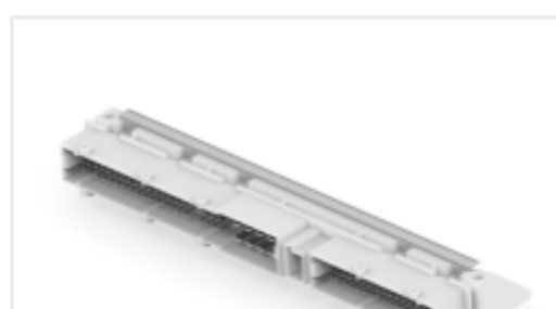
TE Part #5-967224-3 80pos hybrid MQS .63 header 90deg