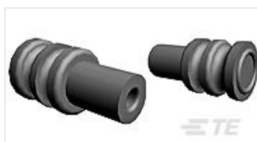
TE Part #964971-1 EINZELLEITERDICHTUNG