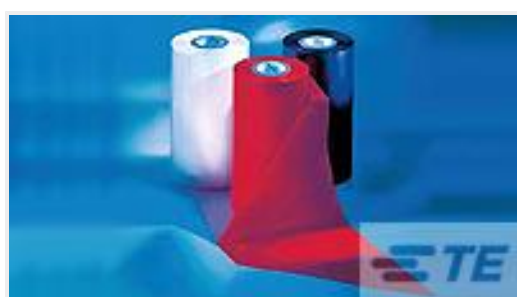
TE Part #754073-000 TMS-RJS-RIBBON-4HT