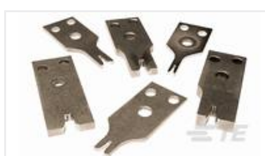
TE Part #4-1633738-0 CRIMPER, WIRE F