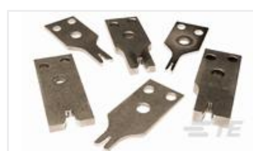
TE Part #2119784-4 CRIMPER, INSUL O PREMIUM