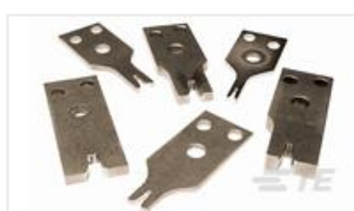
TE Part #1633996-2 CRIMPER, INSUL SPECIAL