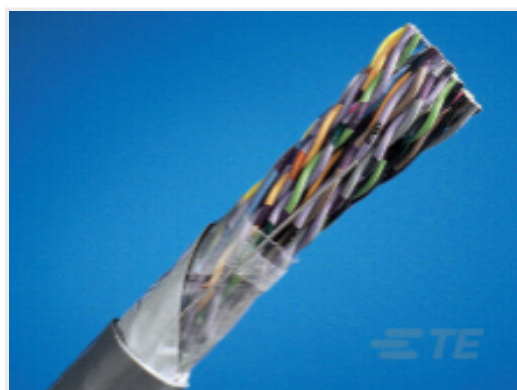
TE Part #50SEJLF005 Madison Spec 101-9467 Rev. 4