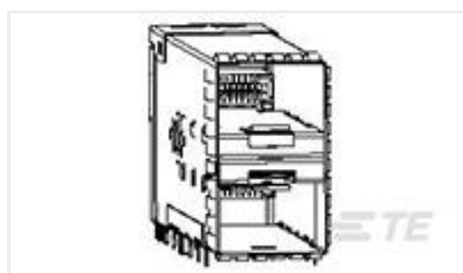
TE Part #2198318-5 zSFP+ STACKED 2X1 RECEPTACLE ASSEMBLY