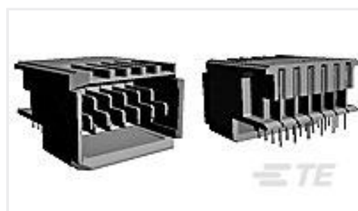
TE Part #5223972-1 UNIV. POWER MODULE R/A HEADER