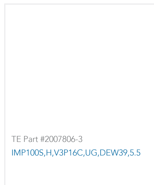
TE Part #2007806-3 IMP100S,H,V3P16C,UG,DEW39,5.5