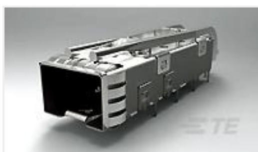
TE Part #2170193-1 SFP+ 1x1 Cage Assembly,w/ Light Pipe