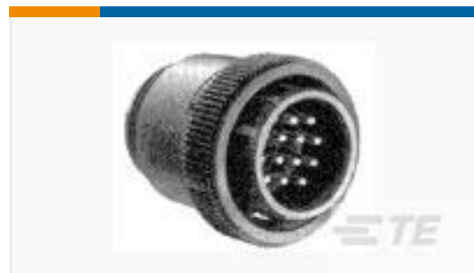
TE Part #206429-1 CPC PLUG ASSY, 11-4, REV SEX