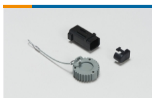
Automotive Connector Caps & Covers (3)