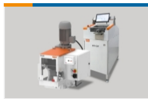
High Voltage Wire Processing Equipment(7)