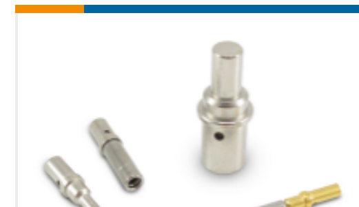
TE Part #0462-201-20141 DEUTSCH SOLID CONTACTS