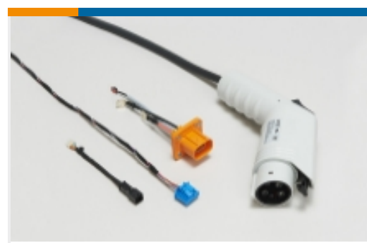
Electric, Hybrid &amp; Fuel Cell Cable Assemblies(6)