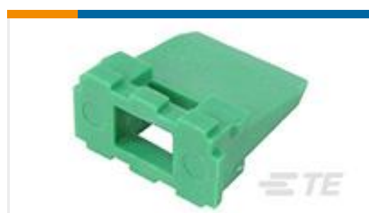
TE Part #W6P WEDGE LOCK, 6P, REC, GRN, DT