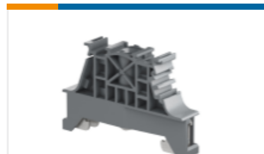
TE Part #1SNK900001R0000 BAM4