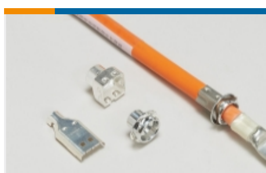
Automotive Connector EMC Shielding (15)