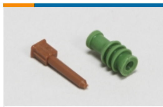
Automotive Seals &amp; Cavity Plugs(7)