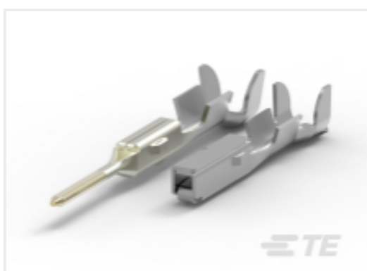
TE Part #CAT-M9194-T273 MULTILOCK, RECEPTACLE AND TAB