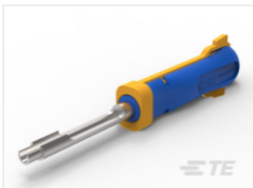
TE Part # 1366865-1 EXT-TOOL FOR 025 TAB