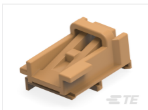
TE Part #1534149-2 MQS RETAINER, BROWN