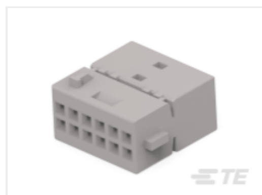
TE Part #2278598-3 12POS MQS REC