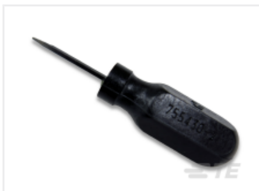
TE Part # 755430-2 EXT, TOOL ASSY