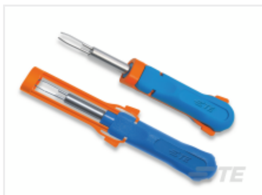
TE Part # 1-1579007-6 EXTRACTION TOOL