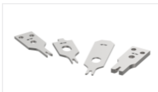
TE Part #1-1633773-6 CRIMPER, WIRE F, STEP