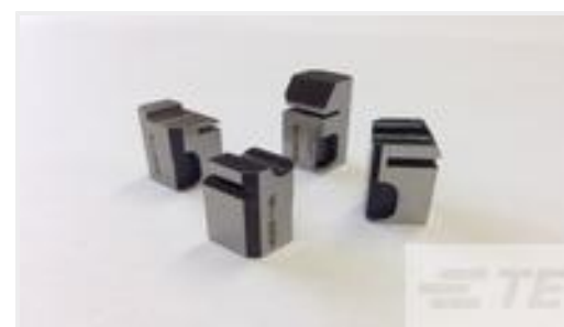
TE Part #1633861-3 FLOATING SHEAR