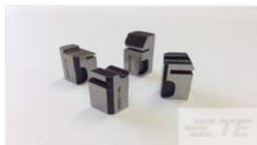
TE Part #318707-1 FLOATING SHEAR